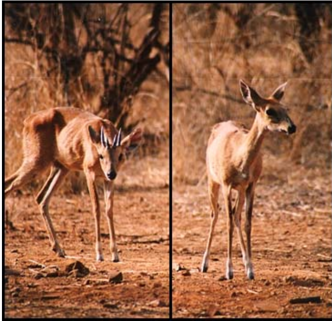
Fig. 5. —Male (left) and female (right) Tetracerus quadricornis associate irregularly and are seen together most often during rut in May–July, Panna National Park, central India.