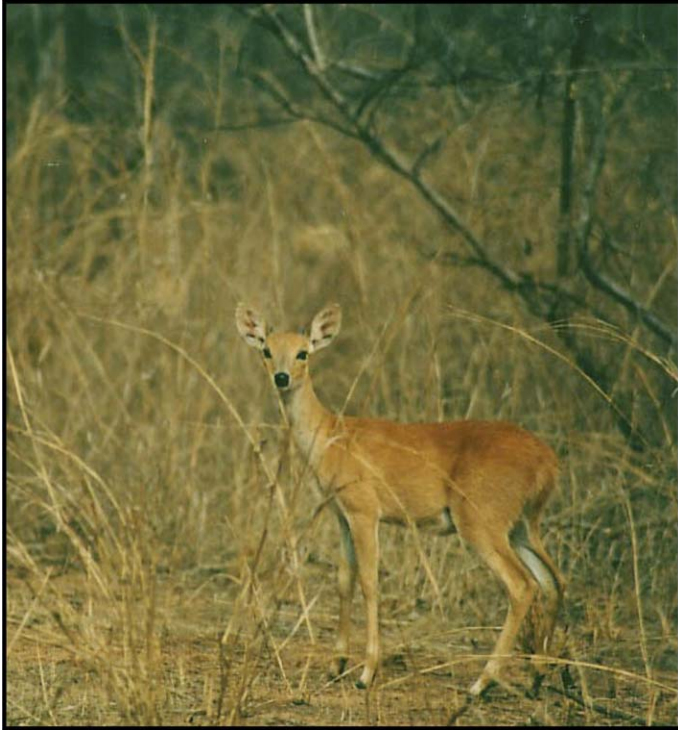
Fig. 4. —Male Tetracerus quadricornis in typical habitat of dry deciduous forest edge, Panna National Park, central India; note inner ear markings that may serve to automimic posterior horns in adult males and enhance threat displays (Guthrie and Petocz 1970).

Age at sexual maturity of wild T. quadricornis is not clearly understood (Grzimek 1990), but 2 captive females had their 1st offspring at 21 months of age (Acharjyo and Misra 1975a, 1975b). Gestation is about 8 months—long for such a small ungulate (Shull 1958); Asdell's (1946) assertion of a 183-day gestation seems to be an underestimate (Crandall 1964). Interparturition intervals of 1 captive female were 285 and 327 days (Acharjyo and Misra 1975a). Of 64 captive births in Paris, France, 59% were twins and 41% were single births; sex ratio at birth was generally equal; and parturition extended from August through May (Mauget et al. 2000). In captivity in native India, average litter size was 1.6 (Acharjyo and Mohapatra 1980), and 7 neonates were 0.74–1.1 kg at birth, 42–46 cm in total length, with shoulder heights of 24.0–27.5 cm (Acharjyo and Misra 1975a, 1981).