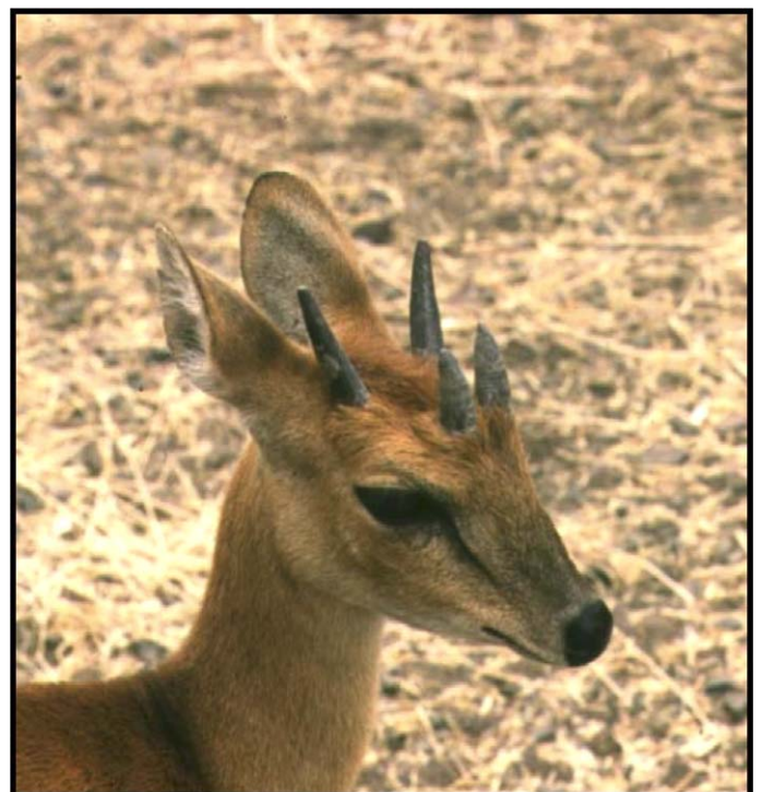
Fig. 1. —Male Tetracerus quadricornis illustrating the 4 horns typical of adult males of 2 subspecies; note enlarged preorbital gland extending below the eye.

CONTEXT AND CONTENT. Order Artiodactyla, suborder Ruminantia, family Bovidae, subfamily Bovinae, tribe Boselaphini. Tetracerus is monotypic.