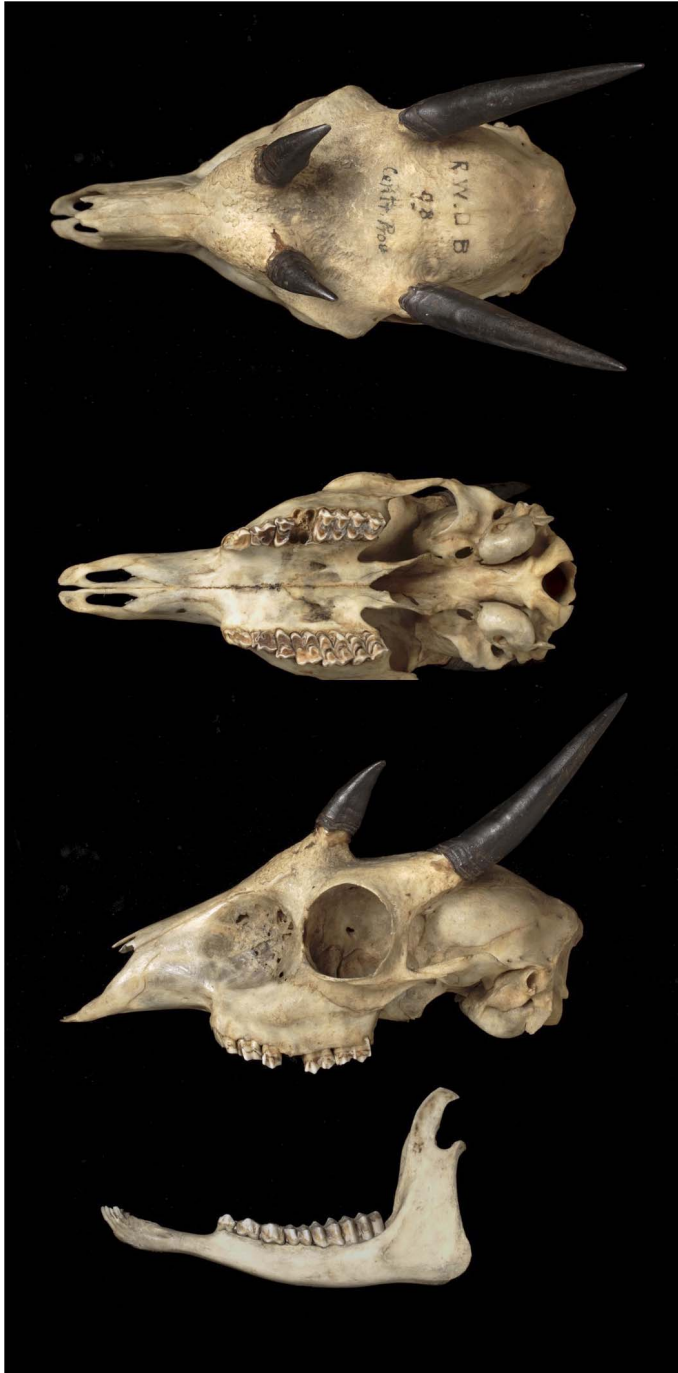
Fig. 2. —Dorsal, ventral, and lateral views of skull (British Museum [Natural History] BMNH specimen 1902.8.14.3) and lateral view of mandible (BMNH 1856.9.22.1) of adult male Tetracerus quadricornis . Greatest length of skull is 179 mm.